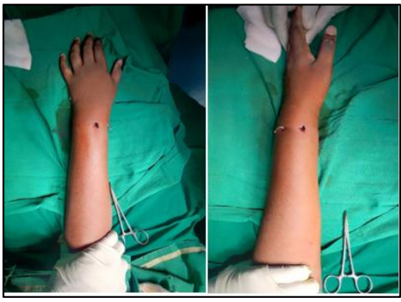
Figure 3: Shows the Intra Op Clinical Pictures