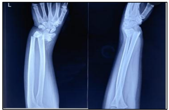
Figure 1: Shows the Pre-Op X-rays

Under anaesthesia patient in supine position local parts painted and draped. Under c arm control fracture fragments visualised. Usually distal fragments are displaced laterally and dorsally. Closed reduction attempted. A 2mm k wire inserted through the fracture site over a dorsal stab incision. It is levered dorsally over distal fragment to control the sagittal deformity. Position checked in c arm in lateral view and once found satisfactory it is drilled into the proximal volar cortex. Now the lateral tilt noted in AP view. Another 2mm k wire inserted through lateral incision over fracture site and the distal lateral fragment levered medially and reduction checked in c arm. After satisfactory reduction k wire is drilled into the proximal medial cortex. Both wires are inserted intrafocally and extraphyseal. Final stability checked in all range of movements. It is checked under fluoroscopic guidance. K wires are bent and cut outside the skin. Sterile dressing applied.