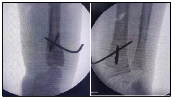
Figure 2: Shows the intra OP C ARM pictures