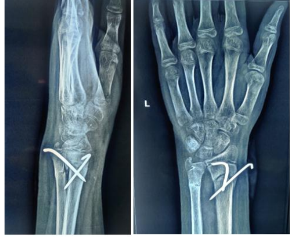
Figure 4: X-Rays at 5 weeks follow up

A total of 20 paediatric distal radius fractures included in our retrospective study. 14 were males and 6 were females. The mean age in our study group was 8 years. The common modes of injury was slip and fall while playing (15 cases), followed by fall from height (4 cases), assault (1 case). All fractures were displaced dorsally and laterally. Intraarticular and physeal injuries were excluded. 12 cases had associated distal ulna fractures. The average time for surgery since injury was 1 day. All patients were operated in supine position on an arm table. C arm was used in all cases. All cases were done by closed reduction only. 2 K-wires of 2mm were used in most of the cases. In Younger age patients and those with small fracture fragment we had used 1.8 mm k wire. All k wires were passed intrafocally and